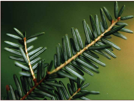
Eastern hemlock.