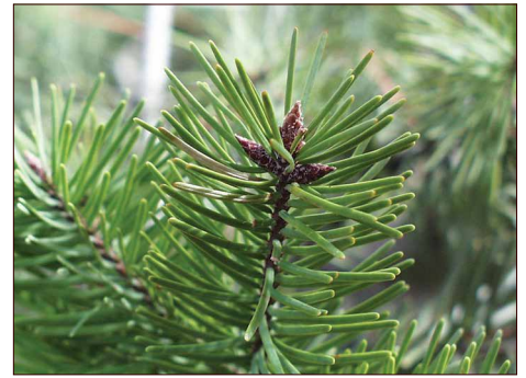
Douglas fir.