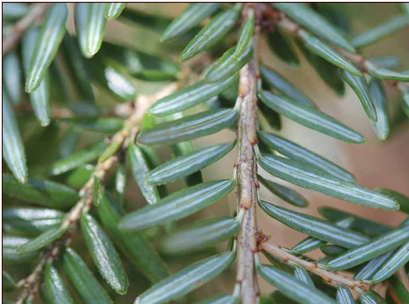
Eastern hemlock.

easiest way to identify hemlock woolly adelgid is to look at hemlock shoots for the white “wool” the adelgid produces while feeding. Each little white ball of wool, called an egg sac, is actually wax secreted by an adelgid. The adelgids feed at the base of the needles, where the needles attach to the woody portion of the shoot. It is often easier to see hemlock woolly adelgid wool on the undersides of shoots, but you can also find them on the upper side as well.