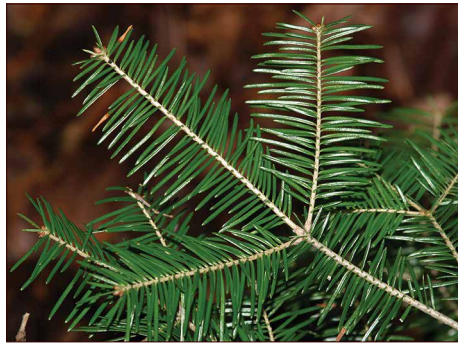
Balsam fir.