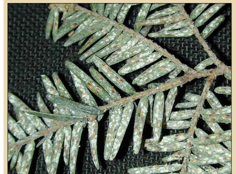
Elongate hemlock scale.