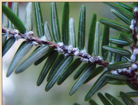
Check hemlock shoots for the hemlock woolly adelgid’s white “wool” egg sac.

look-alike images below to help correct identification.