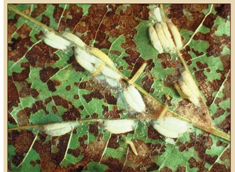
Oak skeletonizer COCOONS.