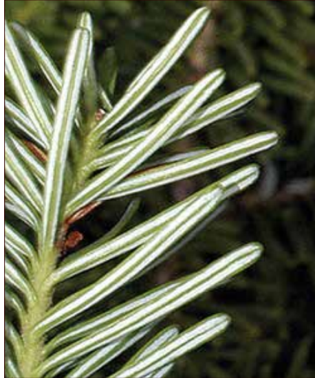
Balsam fir.

found in a few locations in Michigan at this time. Many people who check their hemlock trees may notice small, white spots that look a bit like hemlock woolly adelgid. Other insects, including the elongate hemlock scale, oak skeletonizer cocoons, caterpillar cocoons or spider egg sacs may be present on hemlock needles or shoots. Compare the pictures of hemlock woolly adelgid with the