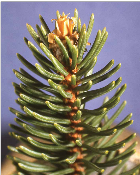
White spruce.

It is critical to be sure you correctly identify whether or not your tree is a hemlock because hemlock woolly adelgid is only found on hemlocks. Once you are sure your tree is a hemlock, you will need to be able to recognize hemlock woolly adelgid. A few other insects can be confused with hemlock woolly adelgid. The