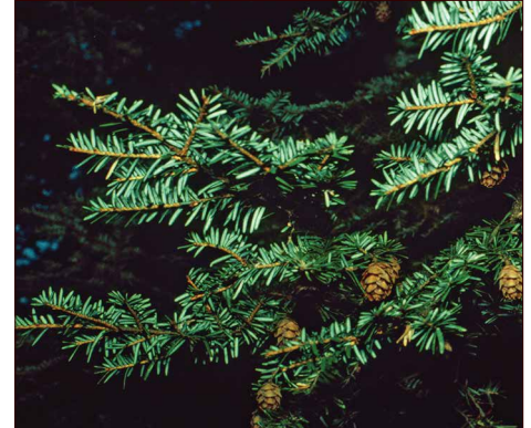
Healthy hemlock tree.

The only other conifers with short, flat needles are firs and Douglas fir, which is technically not a fir. Eastern hemlock needles can be distinguished from fir needles by their shape: they are slightly wider at the base and taper to a rounded tip with a dull point, while fir and Douglas fir needles have parallel sides for nearly the entire length of the needle.